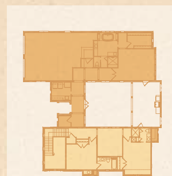
SECOND FLOOR LOCATION

First Floor Guest Suite option +303 Sq. Ft.