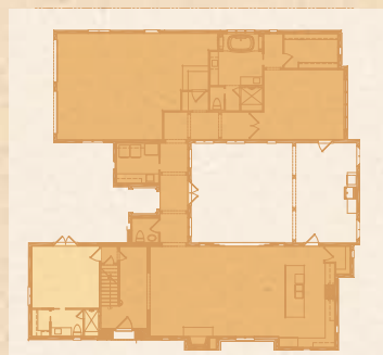
FIRST FLOOR GUEST SUITE OPTION LOCATION