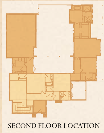
SECOND FLOOR LOCATION